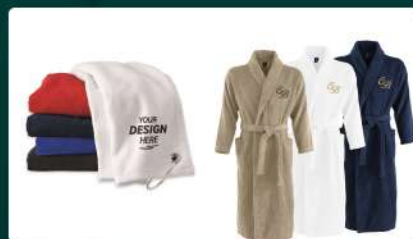
BATH ROBES & TOWELS