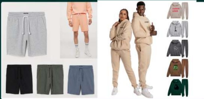
SWEAT-SUIT & SHORT SET