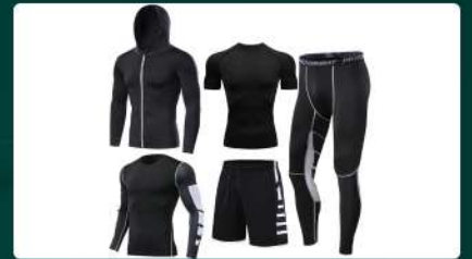
SPORTS & FITNESS UNIFORM