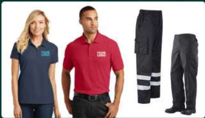
POLO SHIRTS & CARGO PANTS