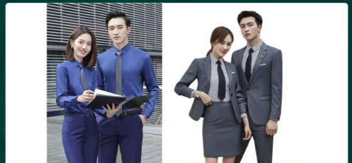
CORPORATE & OFFICE