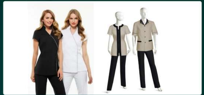
SALON, SPA & HOUSE KEEPING UNIFORM